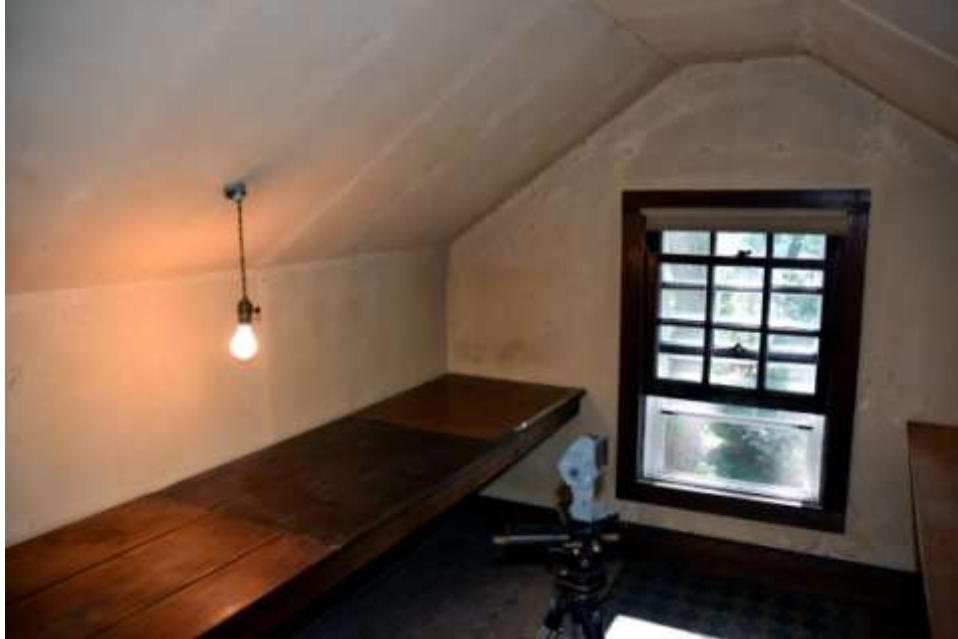
Arthur Collins' 1926 attic ham station and how it looks today in July 2017